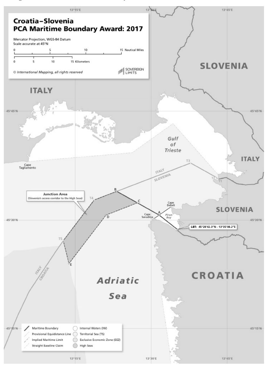
Figure 3. PCA Maritime Boundary Award<sup>152</sup>

rights such that it does not completely disrupt the continuity of Croatia's territorial seas. ^{151}