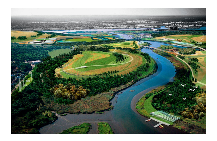
Fig 2. Design of Freshkills Park schematic plan.