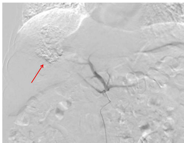
Figure 2 Selective hepatic arteriography and co-infusion of 6 mL of oil iodide + epirubicin 20 mg + oxaliplatin 100 mg into the right hepatic artery via a microcatheter. The red arrow indicates iodized oil deposition in the right hepatic tumor, suggesting a favorable embolization effect.

After two months of combined therapy, contrast-enhanced MRI demonstrated complete resolution of the BDTT and partial response (according to modified Response Evaluation Criteria in Solid Tumors criteria) of the primary tumor (Figure 1B). The patient underwent right hemihepatectomy on September 12, 2023, following a two-week lenvatinib washout period. Intraoperative blood loss was 200 mL. Histopathological examination confirmed poorly differentiated HCC with extensive tumor necrosis (>90% necrosis rate; Figure 3A and B). Postoperatively, antiviral therapy for HBV was maintained, and surveillance MRI at 3-month intervals revealed no recurrence at the latest follow-up (15 months post-surgery; Figure 3C and D).