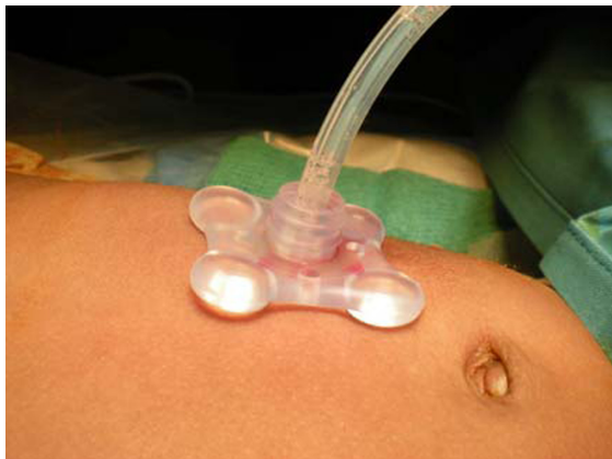
Figure 6 End result of single-incision gastrostomy insertion.

No additional sutures were created to secure the tube externally, as in percutaneous endoscopic gastrostomy.