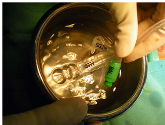
Figure 3 Water bubble is seen as air passes through gastrostomy tube following distension of stomach with 50 cc of air through the nasogastric tube.

Finally, the external retention ring of the gastrostomy tube was securely placed on the skin overlying the wound (Figure 6).