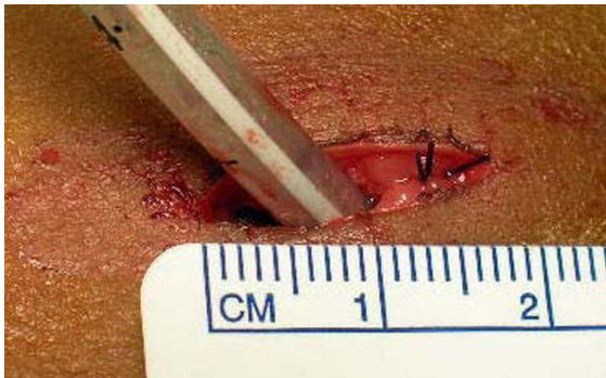
Figure 4 Gastrostomy tube anchored to anterior abdominal wall, note size of wound is less than 2 cm.