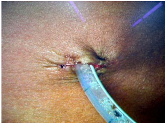
Figure 5 Gastrostomy appearance after closure of subdermal layer.