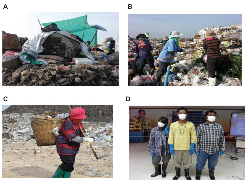
Figure 2 (A) Temporary shelter at a dump site. (B) Routine work activities. (C) Routine work: carrying a load. (D) Personal protective equipment demonstration on training day.

Only 23% of scavengers had received health information from the municipality.