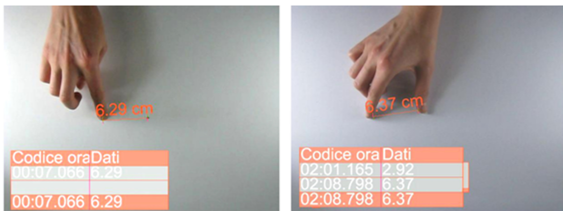
Figure 3 Data resulting from video analysis in a pointing and in a grasping task.

Statistical analysis was not conducted because subjects made no errors during this task.