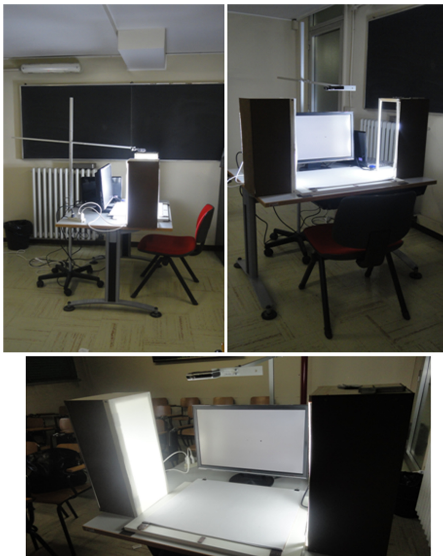
Figure 1 The setting.

increments marked on it placed on the shelf, to correct any possible distortion in the recorded video.