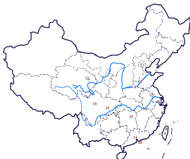
Figure 1 Fifteen national areas implementing minimally invasive esophagectomy in the People's Republic of China.

Notes: High-volume centers: First Affiliated Hospital, School of Medicine, Peking University and Chaoyang Hospital, Capital Medical University in Beijing; Shandong Provincial Hospital, Shandong University in Jinan; The Affiliated Tumor Hospital, Zhengzhou University in Zhengzhou; Jiangsu Provincial Cancer Hospital in Nanjing; Zhongshan Hospital, Fudan University, The Cancer Hospital of Fudan University, Changzheng Hospital, Second Military Medical University and Shanghai Chest Hospital, Shanghai Jiaotong University in Shanghai; Taizhou Hospital, Wenzhou Medical College in Taizhou; Affiliated Union Hospital of Fujian Medical University and Fujian Provincial Tumor Hospital of Fujian Medical University in Fuzhou; Chang Gung Memorial Hospital, Chang Gung Medical College in Taipei; Tungs' Taichung MetroHarbor Hospital in Taichung; University of Hong Kong Medical Centre, Queen Mary Hospital and The Chinese University of Hong Kong, Prince of Wales Hospital in Hongkong; Nanfang Hospital, Southern Medical University and Cancer Center, Sun Yatsen University in Guangzhou; Second Xiangya Hospital of Central South University in Changsha; Daping Hospital, Third Military Medical University in Chongqing; West China Hospital, Sichuan University in Chengdu; The Second Clinical Institute, North Sichuan Medical College in Nanchong.