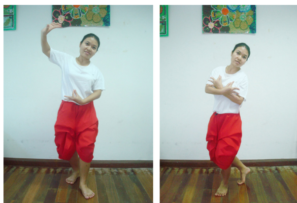
Figure 2 Type of traditional Thai dance.