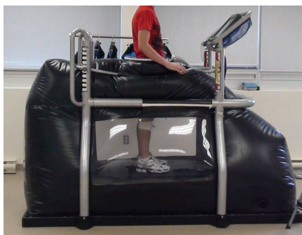
Figure 1 Subject walking on a G-Trainer treadmill under lower body positive pressure support.

Recently, a new treadmill (G-Trainer ® treadmill by AlterG Inc, Fremont, CA, USA) (Figure 1) was introduced that permits low-load walking using an emerging technology called LBPP. 27 The system utilizes a waist-high air chamber