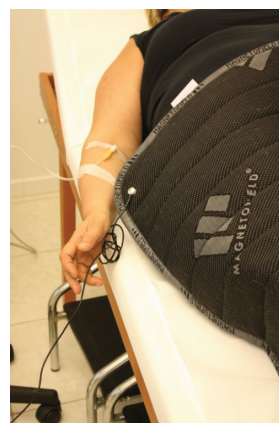
Figure 1 Patient undergoing PEMF therapy (right leg). Abbreviation: PEMF, pulsed electromagnetic field.