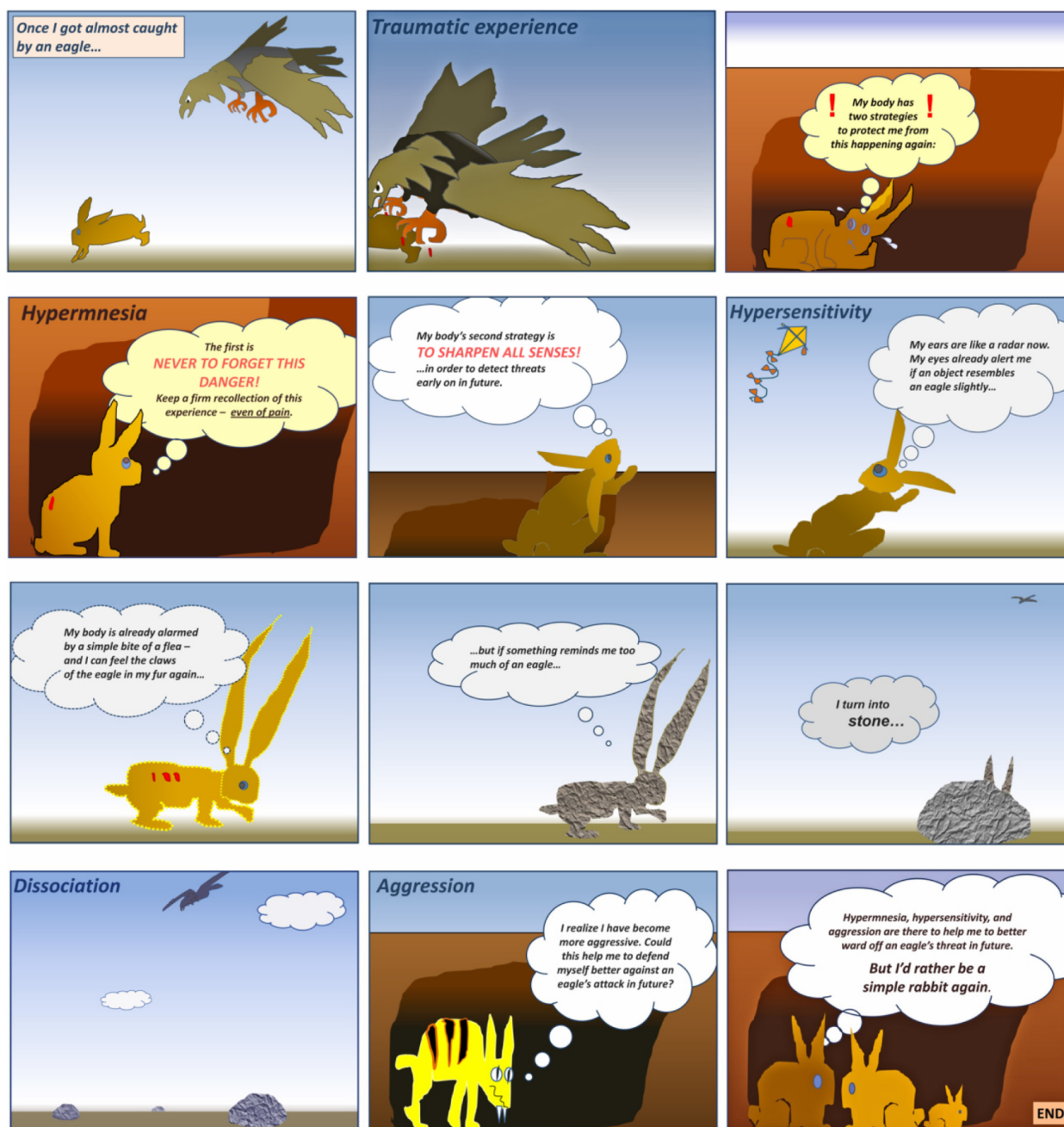
Figure 2 The hypermnnesia–hyperarousal model: easily understandable educational material.

that, with respect to neuroperception, an additive effect takes place if both systems are activated. 30,31 Neugebauer et al imply a relationship with some direct modulation by the laterocapsular division of the central nucleus of the amygdala, assuming this to be of major importance in traumatogenic pain genesis. 32