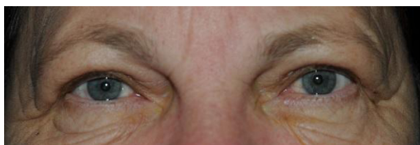
Figure 2 Slight periorbital edema, not inducing ptosis or dermatochalasis, no treatment necessary.

The periorbital edema is often mild, and does not require therapy. In severe cases, blepharoplasty can be performed and treatment with imatinib can be continued. 39 An alternative option for patients rejecting an operation would be a trial of conservative therapy with diuretics.