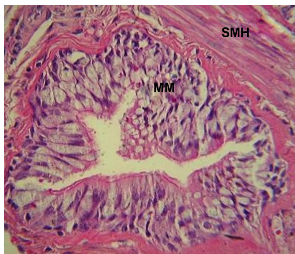
Figure 2 MM and smooth muscle hypertrophy in a small airway from a COPD patient.

The prevalence of CB is higher in COPD patients. 13,24,25 In the Evaluation of COPD Longitudinally to Identify