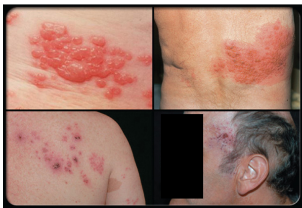
Figure 1 Herpes zoster (shingles) rash.

Notes: Herpes zoster (shingles) rash consists of painful skin blisters that erupt usually on only one side of the body along the distribution of a nerve on a single dermatome. Typically, this occurs along the chest, abdomen, back, or face, but it may also affect the neck, limbs, or lower back. © 2005 The McGraw Hill Companies, Inc. Images from Wolff K, Johnson R, Fitzpatrick TB. Fitzpatrick's color atlas and synopsis of clinical dermatology . 5th Ed. New York; McGraw-Hill Education; 2005. 66