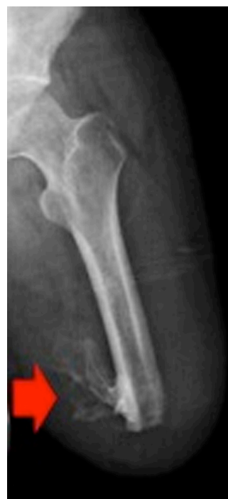
Figure 1 Radiographic image demonstrating heterotopic ossification within the residual limb of a combat-injured service member.

Assessing hypoxia-induced HO from tourniquet usage remains challenging, as it was not until July 2004 that the United States Army's Institute of Surgical Research issued a recommendation that every soldier carry a modern tourniquet. 22 Additionally, correlating tourniquet-induced HO in previous military conflicts is not feasible, since poor medical documentation and inadequate application of these medical devices prevent large-scale meta-analyses. 5 Therefore, this article focuses on the basics of bone biology and how tourniquet usage following combat trauma