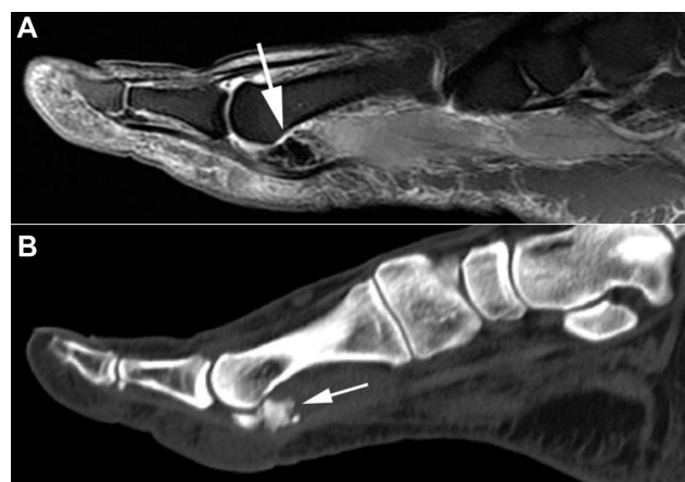
Figure 2 (A) A fat-saturated fast SE T2 weighted sagittal image shows an amorphous signal void area compatible with calcification underneath the flexor tendon of the great toe (arrow). (B) A sagittal reformatted computed tomography image corresponding to Figure 2A confirms that the lesion is a calcified mass (arrow).