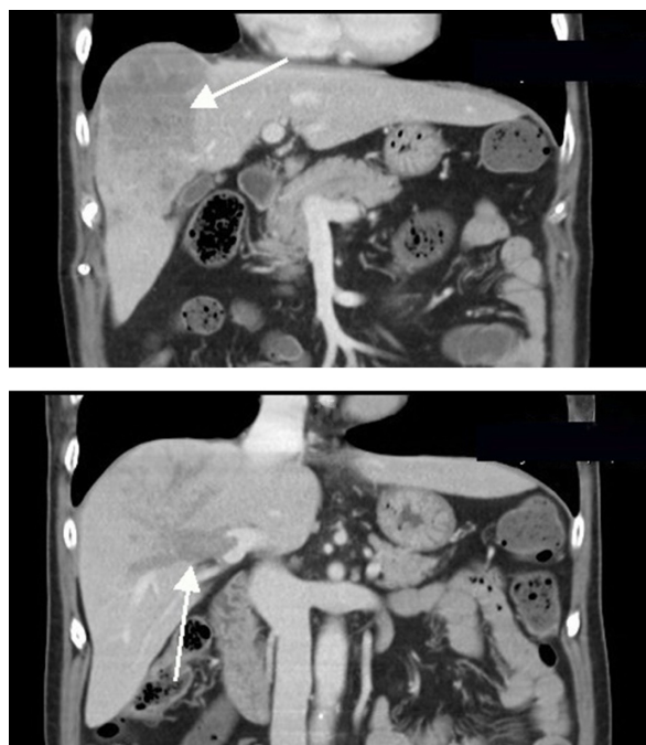
Figure 1 Multiphase computed tomography before sorafenib treatment. Notes: (A) An 8 cm heterogeneous enhancement liver tumor at segment 8 in arterial phase (arrow); (B) right portal vein thrombosis in portal phase (arrow).

Sorafenib is a multikinase inhibitor that inhibits angiogenesis and tumor growth. The efficacy of sorafenib has been shown in two Phase III clinical trials. 2,3 The survival rates in these two clinical trials were all significantly higher in the sorafenib group compared with in the placebo group. However, no patients achieved a CR in these two clinical trials, in which tumor response rate was assessed by Response Evaluation