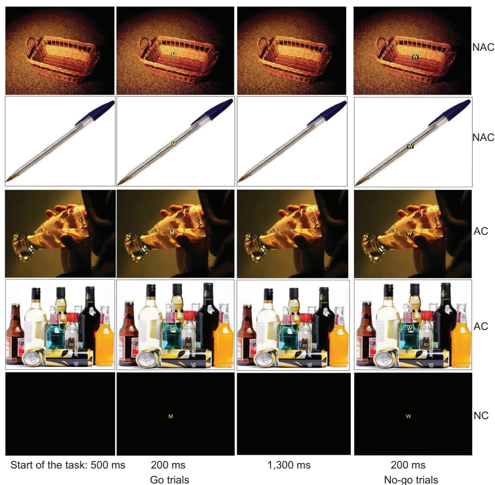
Figure 1 Go/no-go task.

We used the go/no-go task we previously developed 14 to assess the modulation of inhibition by alcohol-related context. During the go/no-go task, participants were instructed to press a button with the thumb of their right hand, as fast and accurately as possible, whenever the letter M (go) was displayed, and to withhold pressing the button when the letter W (no-go) was displayed. Both letters were superimposed on pictorial backgrounds denoting three different emotional contexts. The neutral background (NC) was represented by a black screen, while two different alcohol-related pictures represented the alcohol background (AC), and two different nonalcohol-related pictures the nonalcohol background (NAC) (see Figure 1). The neutral background