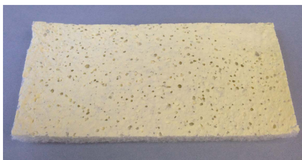
Figure 1 TachoSil fibrin sealant patch with active yellow side facing upwards.

Its safety profile is related to the use of pooled human plasma-derived fibrinogen and thrombin as well as equine collagen. 7,20 The pooled plasma may be associated with blood-borne disease transmission of viruses and prions. 20 Thus, there is a potential risk of HIV, hepatitis A, parvovirus B19, and Creutzfeldt–Jakob disease (CJD) transmission. 7 Efforts to minimize these risks include donor screening for a high-risk history, serologic and polymerase chain reaction testing, and antiviral processing such as pasteurization, precipitation, adsorption, pH, and gamma irradiation. 7 There is also a risk of allergic reaction and anaphylaxis in patients sensitive to human or horse proteins, as well as the risk of thromboembolism. 7 The patch should not be used intravascularly, in the renal pelvis or near the ureter, in between the edges of the skin, in neurosurgery, in closed or infected spaces, or in treating severe or brisk arterial bleeding. 7 In addition, overpacking of patches should be avoided. 7 Migration of the patch inside the body is possible. 7 Exposure of the patch to alcohol, iodine, or heavy metals can inactivate the patch. 7 There are limitations on the number of patches that should be used in a patient depending on