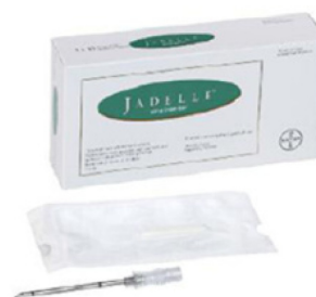
Figure 1 Jadelle packet showing disposable trocar.

ENG implants are safe and highly effective. 15 There is no significant difference in pregnancy rates between ENG and LNG implants. 16