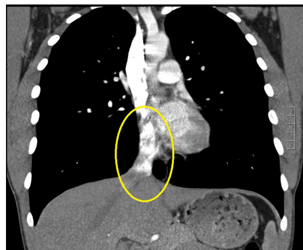
Figure 2 Hepatic IVC (circled).

The patient was treated with a catheter-assisted mechanical thrombectomy. The patient also received a power-pulse spray using 8 mg tissue plasminogen activator (TPA) and an additional 2 mg TPA via the infusion catheter. Balloon maceration of the thrombus was performed using a 10 mm × 4 cm balloon catheter. The patient was effectively administered catheter-directed thrombolysis with TPA at 1 mg/hour over