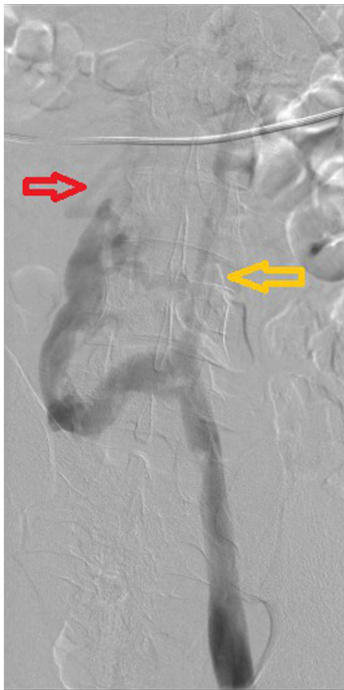
Figure 4 Lower extremity venogram. Interrupted IVC (yellow arrow) and lower extremity drained by hemiazygos veins (red arrow).