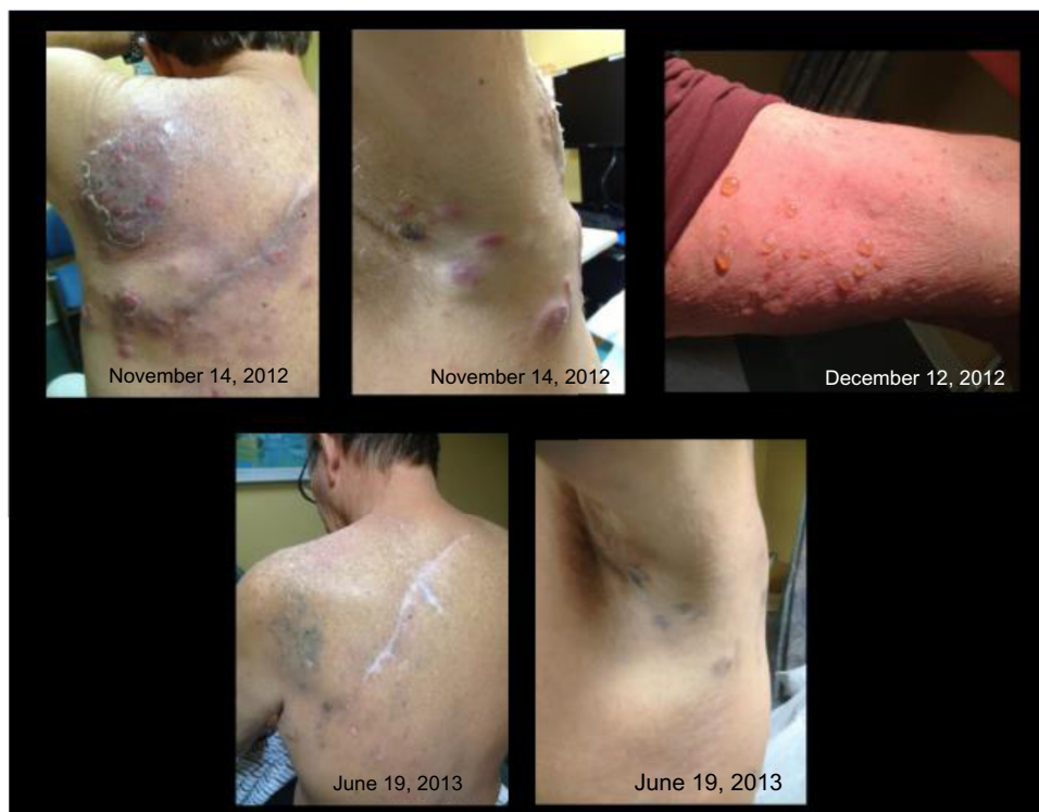
Figure 2 November 14, 2012: multiple satellite and in transit lesions on the left lateral back, palpable left cervical lymph nodes and left axillary lymphadenopathy, accompanied by a grade 1 erythematous rash on the lateral chest wall after the first dose of ipilimumab. December 12, 2012: grade 3 pemphigoid rash with bullous lesions in the upper extremity. June 19, 2013: currently a few decreasing residual subcutaneous nodules and vitiligo are appreciated in the upper extremities.

No published data addressing the safety and efficacy of ipilimumab in patients with ESRD on hemodialysis