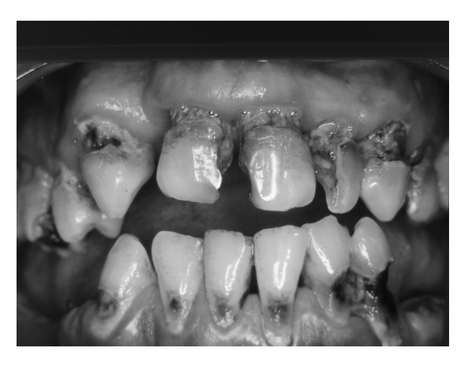
Figure 2 Root carries are common in the elderly.

reflex activity is maintained until very old age (Kossioni and Karkazis 1998). This is probably due to continuous use of jaw muscles for chewing, swallowing, speaking, smiling and to the particular functional role of these reflexes in humans.