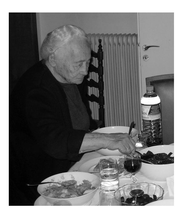
Figure 3 Chewing ability in the elderly is important to maintain a normal social life.

However there are studies indicating that the correlation between masticatory variables and dietary selection is weak in the elderly (Osterberg et al 2002), while the improvement of dentures, or the fabrication of new ones have little effect on dietary selection (Sandstrom and Lindquist 1987; Laurin et al 1992). It is true that food selection is influenced by various factors such as cost, institutionalization, general medical condition, pain, xerostomia, loneliness, income, knowledge, culture, background etc (Heath 1982; Chen and Lowenstein 1984; Kossioni and Karkazis 1999; Sheiham et al 1999; Osterberg et al 2002). Chen and Lowenstein (1984) showed a positive