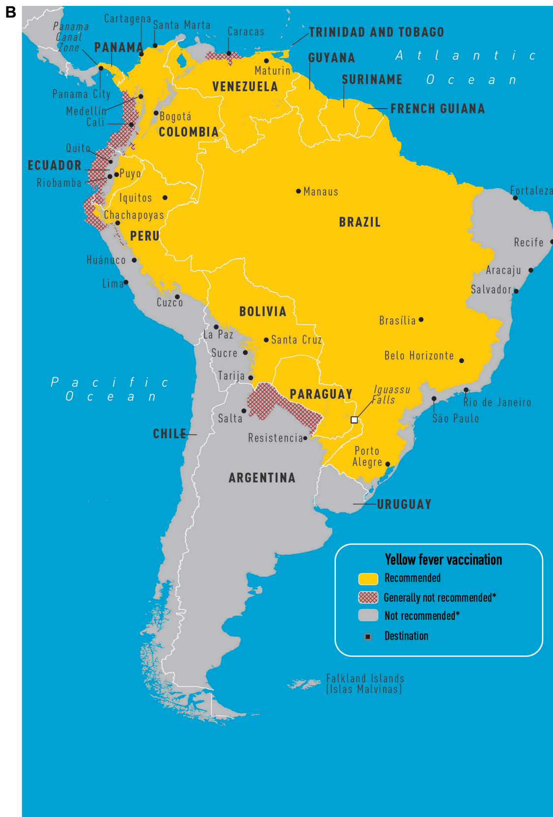
Figure 1 CDC maps of regions of Africa ( A ) and South America ( B ) at risk for yellow fever transmission. 49

Notes: Yellow-shaded regions represent areas where vaccination is recommended, while gray areas have minimal risk of yellow fever transmission. *Not recommended unless individual practice patterns suggest higher risk. The CDC plans to publish updated maps in 2015, and the most current recommendations can be found online at www.cdc.gov . Copyright © 2014. Adapted from Gershman MD, Staples JE. Infectious Diseases Related to Travel: Yellow Fever . Chapter 3: Yellow Book; 2014. Available from: http://wwwnc.cdc.gov/travel/yellowbook/2014/chapter-3-infectious-diseases-related-to-travel/yellow-fever . 49