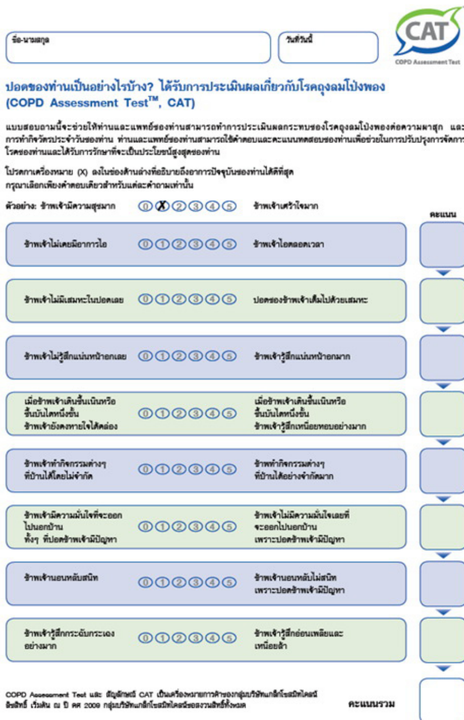
Table S1 Thai version