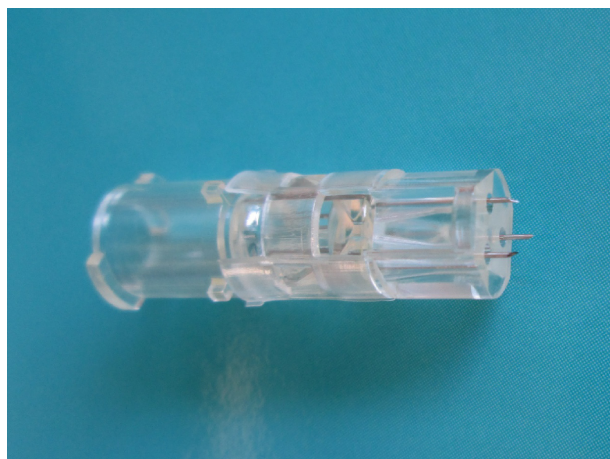
Figure 1 A photograph of the TMD with three fine, stainless steel needles. Abbreviation: TMD, three-microneedle device.

The mean volume of lidocaine hydrochloride per unit area to elicit anesthesia using the TMD was significantly lower