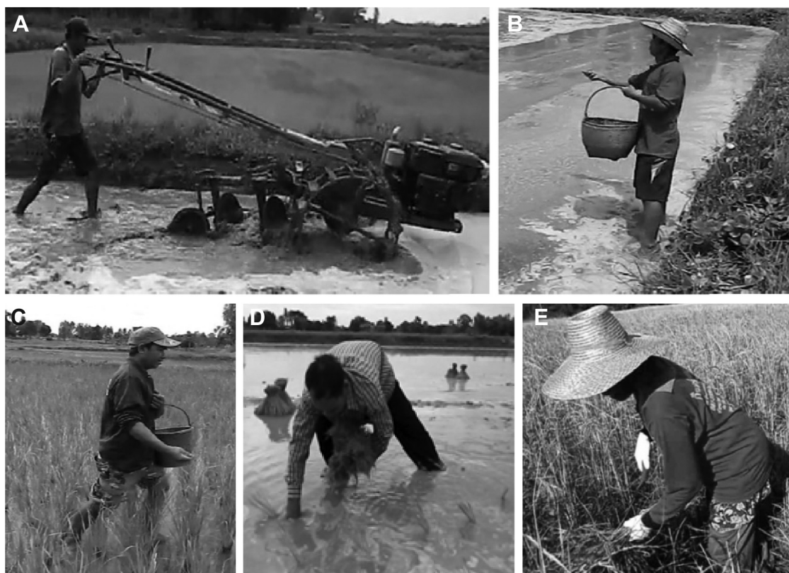
Figure 1 Typical rice cultivation processes including: (A) plowing; (B) seeding; (C) nursing and fertilizing; (D) planting; and (E) harvesting.

Females are generally exposed to a higher risk of lower extremity malalignment due to different anatomical alignment, lower pain thresholds, and lower physical tolerance than males. 17–20 Previous studies found that females are at increased risk of abnormal anterior pelvic tilt, femoral antetorsion, Q angle, tibiofemoral malalignment, and genu recurvatum. 17,18 However, the sex difference for limb