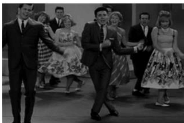
Figure 1 From two consecutive scenes in the movie, Hairspray . Note widening of the distance between two hands, as the artist (in the center) moves his hands simultaneously to the right. This is related to the invasion of the midline by the right arm seen in the scene below, indicating larger excursion by the dominant side. On the other hand respect for the midline by the nondominant hand is noted in the scene above. The larger excursion by the dominant hand means its faster speed as the hands move simultaneously from side to side. See text for further explanation.

to the right and decreases as they move to the left. Clearly, the difference in distance between the two hands (in the two frames) is due to the crossing of midline (represented by the artist's tie) by the right hand as the hands move to the left (seen in the second frame). This situation will also occur if the hands were to move vertically as with the movements performed in piano playing (see below).