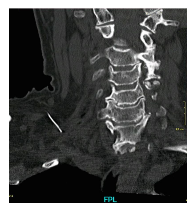
Figure 2 Computed tomography scan (frontal view) of residual metal wire.

After a thorough discussion of this topic with the orthopedic consultant, and within this framework, the patient gave consent for surgical removal by a neurosurgeon and an ENT surgeon who specializes in neck dissections, performed under general anesthesia. After the induction of general anesthesia and complete muscular relaxation in the afternoon, the ENT surgeon performed forceful traction again. The complete residual wire, including the complete characteristic steel wire tip, was successfully removed during this last attempt. Therefore, a surgical incision was not performed. After the termination of anesthesia, the patient had no neurological sequelae or pain at the insertion site or close to the plexus. She was discharged home on the following day.