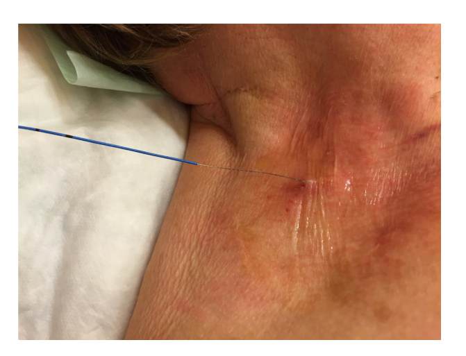
\ensuremath{\mbox{Figure I}} Ind<br/>welling steel wire and separated polyure<br/>thane catheter at the supraclavicular plexus.

could not remove the indwelling residual steel wire. Notably, the patient complained of pain during gentle traction via the residual wire. Another removal attempt was performed in our post anesthesia care unit under standard monitoring and mild analgosedation using fentanyl 0.1 mg intravenously. Under ultrasound guidance, the residual wire was traced backwards to its final position next to the supraclavicular plexus. Traction of the wire resulted in tissue movements next to the plexus fascia and patient discomfort. The completely removed polyurethane component was visually checked and showed no signs of incisions, kinking or otherwise expected damage. Under sterile conditions, the proximal polyurethane catheter component was cut away. In another attempt, the residual wire was threaded through a 16 G intravenous catheter (Braunuele, B Braun Medical, Melsungen, Germany) and then the catheter was advanced retrogradely through the skin until resistance occurred (~4 cm beneath the skin). Another attempt to remove the indwelling wire through this artificial tunnel under forced traction unfortunately failed again.