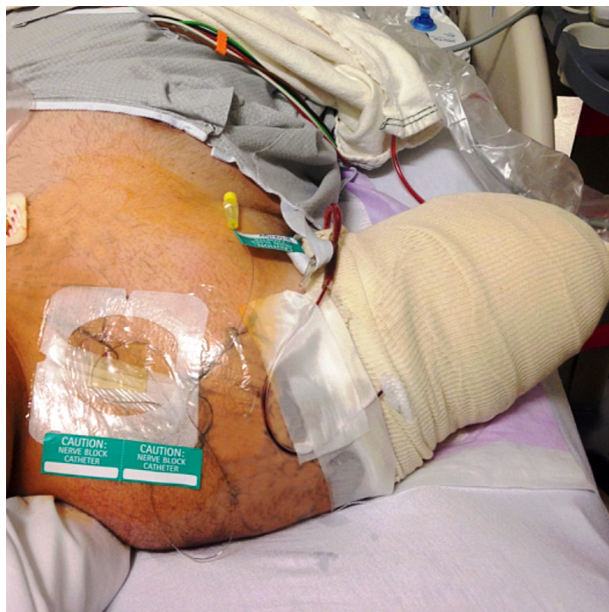
Figure 1 Patient who had suffered a traumatic amputation of the mid-humerus following a motorcycle crash.

Since 20% of multitrauma patients have both upper and lower extremity injuries, the opportunity to use multiple catheters arises frequently. For example, Plunkett and Buckenmaier placed bilateral sciatic nerve catheters and a single femoral nerve catheter in a patient with bilateral leg injuries who was receiving treatment doses of enoxaparin that precluded epidural analgesia. 31 Care must be taken to consider the dose of local anesthetic that is being delivered in order to prevent toxic plasma levels; however, this is rarely an issue since the concentrations that are used clinically for catheters are low (eg, 0.1%–0.2% ropivacaine). One prospective study of 13 combat trauma patients receiving 0.2% ropivacaine infusions at 6–14 mL/h for a period of 4–25 days showed a median unbound plasma ropivacaine level of 0.11 mg/L (range, undetectable to 0.63 mg/L) over the duration of the