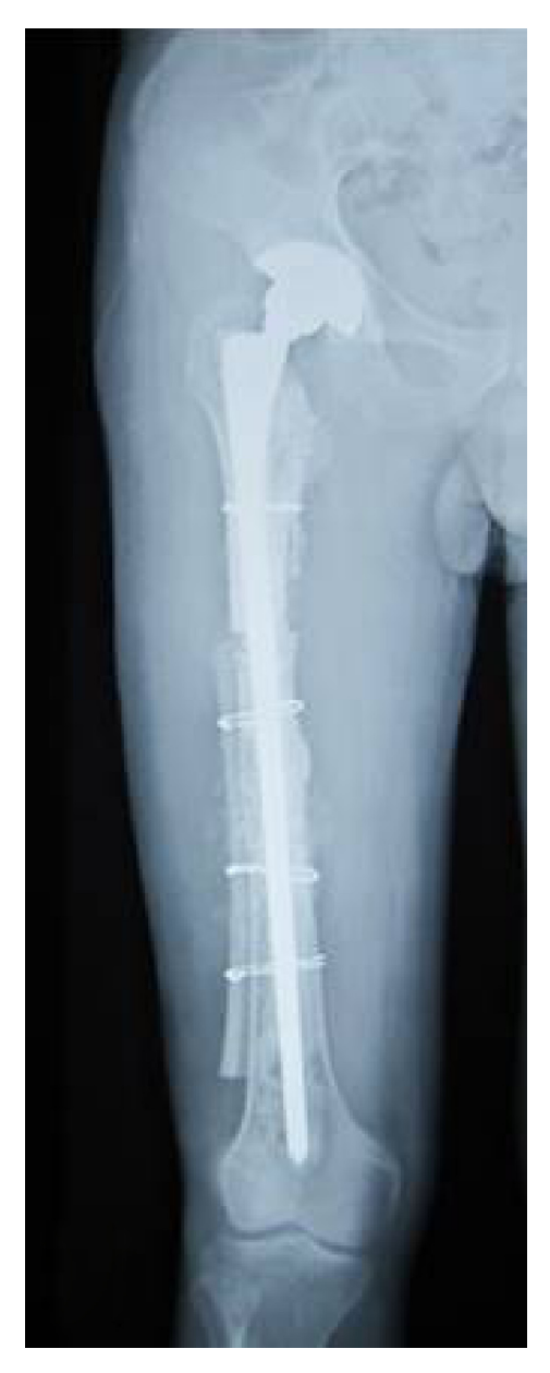
Figure 6 The radiograph shows a I-year postoperative AP after uncemented allograft prosthesis composite revision. Abbreviation: AP, anterior-posterior X-ray.

some of our questions could not be definitely addressed by the study. Given the relative rarity of this problem and the unique treatment for each individual, it would be difficult to obtain a large series with sufficient power to address these important questions. Nevertheless, we could see some meaningful trends.