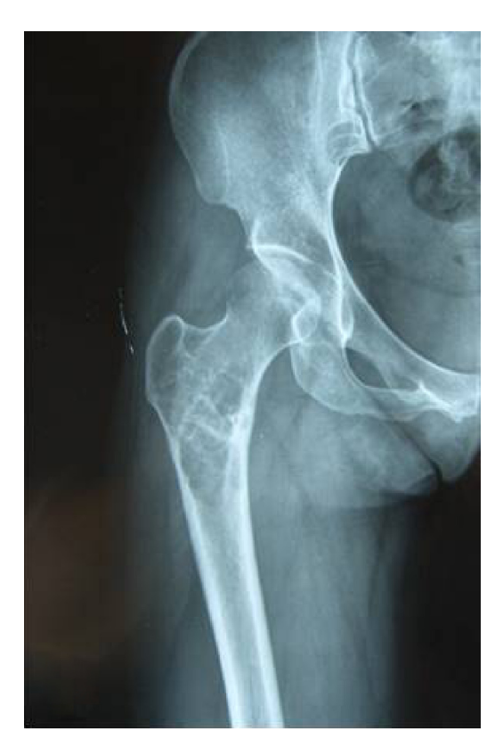
Figure 1 The radiograph shows the preoperative AP of a chondrosarcoma. Abbreviation: AP, anterior-posterior X-ray.

allograft was selected. Before surgery, a biopsy was done. Patients diagnosed as malignant bone tumor were treated with neoadjuvant chemotherapy routinely.