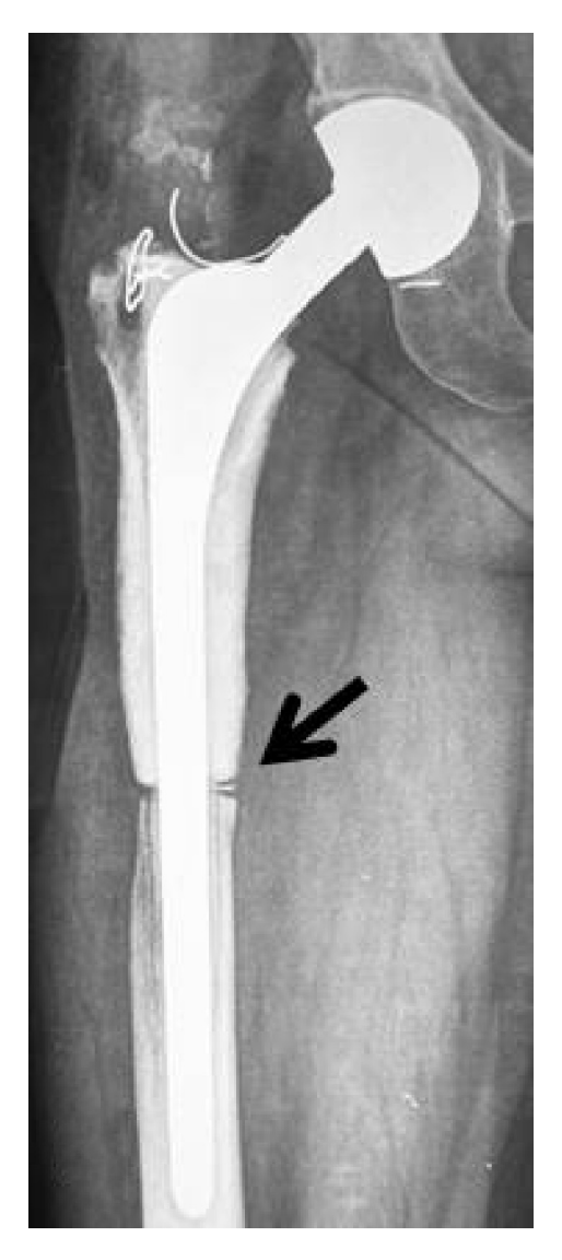
Figure 7 The radiograph shows a 3-year postoperative AP of a cemented allograft prosthesis composite for an osteosarcoma.

The selection of patients who are appropriate for limb-sparing surgery of the proximal femur is vitally important and is more likely to affect the clinical and functional results than is the choice of implant. But until now, the indications have not been absolutely established. Gross and Hutchison support the use of proximal femoral allograft for the reconstruction of circumferential defects of more than 3 cm in length from