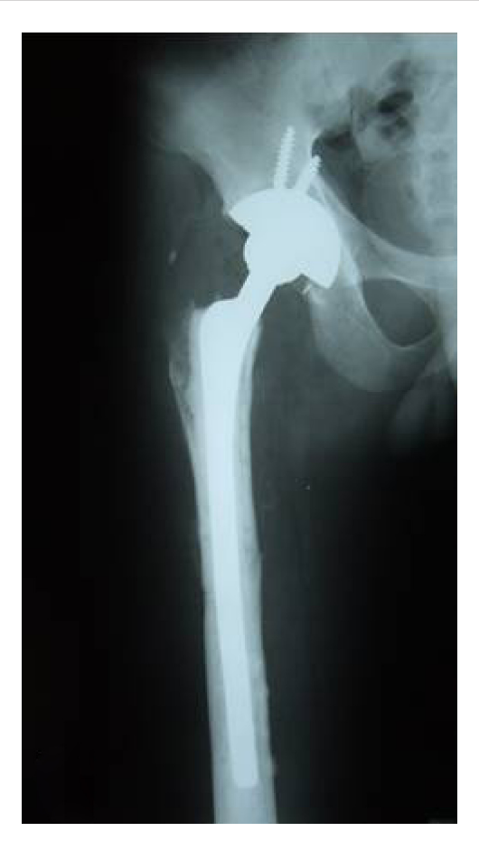
Figure 4 The radiograph shows a 6-year postoperative AP of a cemented allograft prosthesis composite for a malignant fibrous histiocytoma before revision. Abbreviation: AP, anterior-posterior X-ray.

There were no cases of recurrence, but metastasis was found in two hips (less than 20 months), which caused the death finally, and the diagnosis in these two cases were osteosarcoma and chondrosarcoma. All of the three deceased patients had undergone sufficient neoadjuvant chemotherapy.