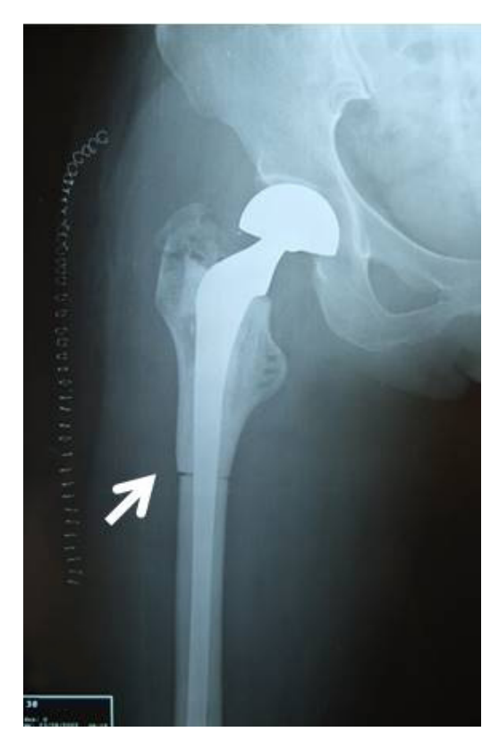
Figure 2 The radiograph shows the immediate postoperative AP of a cemented allograft prosthesis composite for a chondrosarcoma (Ennecking IA). Note: The white arrow indicates the allograft host–bone junction. Abbreviation: AP, anterior-posterior X-ray.