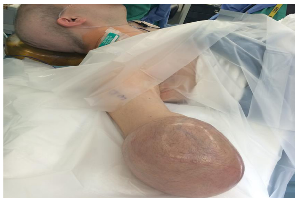
Figure 1 Preoperative photograph showing tumor progression and involvement of the area of previous amputation.