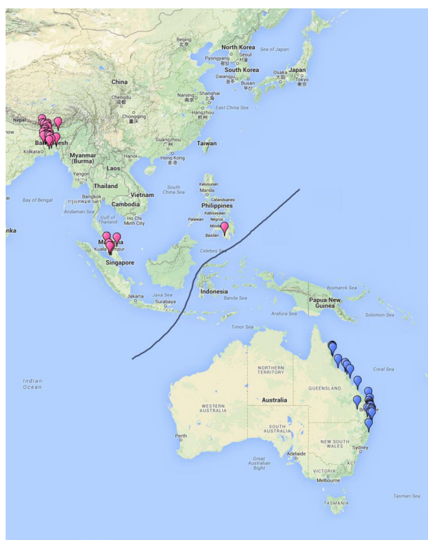
Figure 1 Geographical locations of up to date reported Hendra virus (blue) and Nipah virus (pink) outbreaks.

NiV was first identified as an etiological agent of human encephalitis and severe pulmonary disease in the early outbreaks of 2001 in Bangladesh, and retrospectively also in India's West Bengal. The virus causes seasonal, relatively small outbreaks with mortality rates as high as 75% compared to the 40% seen in the outbreak in Malaysia, with an