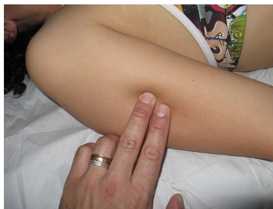
Figure 4 Fascial treatment of the radial nerve in the peripheral nervous system.

direct trauma that might damage the radial nerve. 27-29 The method of treating any emergence of the peripheral nerve is relatively simple and noninvasive. Once the fingers are in contact with the emergence and the most superficial area of the nerve branches, a fascial osteopathic technique is used,