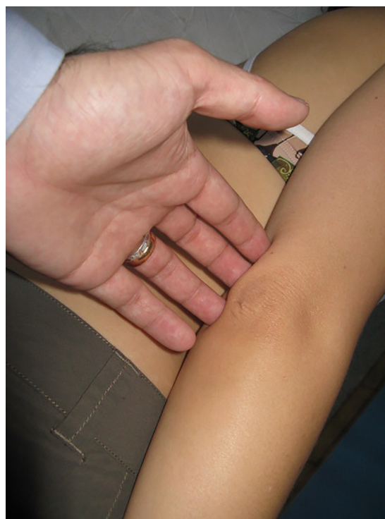
Figure 3 Fascial treatment of the ulnar nerve in the peripheral nervous system.

Ulnar compression difficulties may be encountered at the cubital tunnel level, while the humeral area is subject to