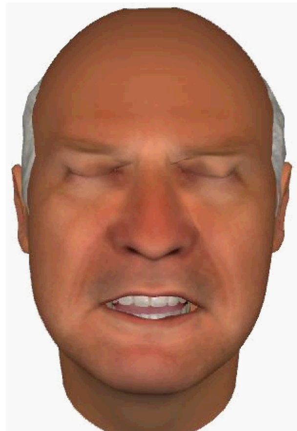
Figure 2 Still frame of a VH patient displaying high pain.

Of the 96 participants who completed this study, approximately 60% were female, 65% were Caucasian, 69% were non-Hispanic, and 96% were single. The average age of the participants in this study was 20.6 years.