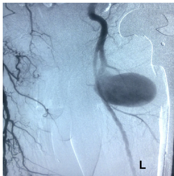
Figure 2 Angiogram showing the pseudoaneurysm was detected in profunda branch of femoris artery and periprosthetic destructive area.