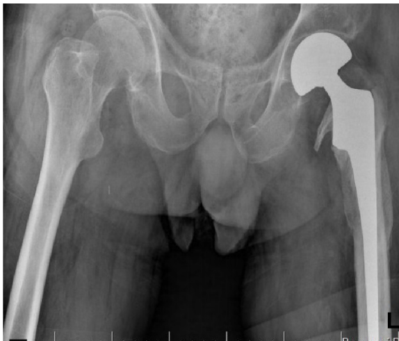
Figure 4 On the control visit at year 2, it was seen that the osteolytic area had completely recovered.