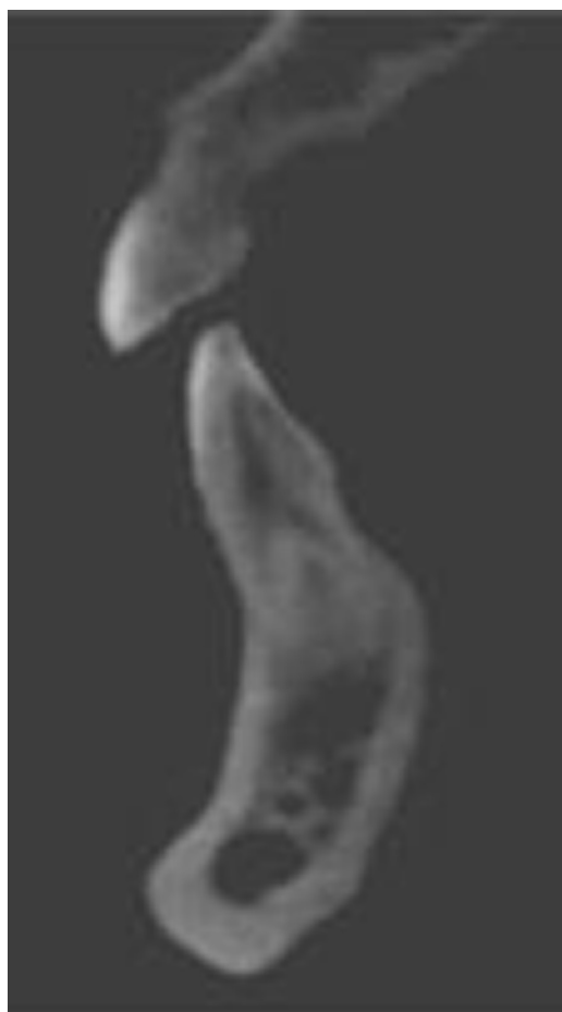
Figure 3 CBCT images showing additional canal morphology (type IX) in permanent mandibular anterior teeth.

Abbreviation: CBCT, cone-beam computed tomography.