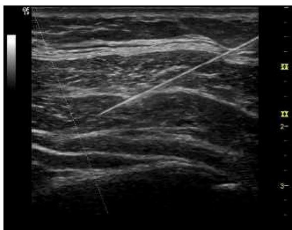
Figure 4 Needle placement in TAP block. Abbreviation: TAP, transversus abdominis plane.

insertion approach. The mean cumulative morphine requirement over the first 48 hours postoperative period was significantly less in the block group. In spite of the presence of the catheter, this study has examined only a single dose of 20 mL 0.25% bupivacaine with which they could demonstrate reduced analgesic requirement for 48 hours.