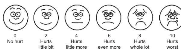
Figure 1 Visual analog scale.

Patients were given intravenous paracetamol if VAS >3, maximally four times a day at 6-hour intervals. At any time, if pain relief was inadequate (VAS >6), tramadol was given in a