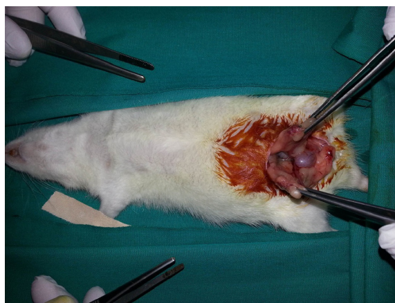
Figure 1 Bilateral ovaries after midline laparotomy in the sham group.

In the torsion + detorsion + honokiol group (Group V), honokiol (25 mg, Honokiol; Sigma-Aldrich Co., St Louis, MO, USA; honokiol dose: 2 mg of honokiol was dissolved in 2 mL of dimethylsulfoxide) was injected by intraperitoneal route 30 minutes before detorsion. Then, relaparotomy was performed for the purpose of detorsion in bilateral adnexa, and the incision was sutured. Both ovaries were surgically removed after 3 hours of detorsion (Figure 3). Intracardiac blood was taken from all the groups after completion of