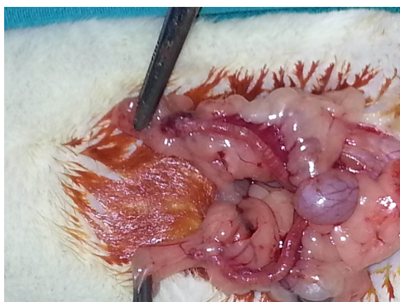
Figure 3 The appearance of the ovaries after honokiol.

Ovarian tissues were fixed in 10% neutral buffered formalin solution for 48 hours and were dehydrated, cleared, and embedded in paraffin, as usual. Serial tissue sections, which were 4\ \mu\text{m} thick, were cut using a microtome (Leica RM2125RTS) and stained with hematoxylin and eosin for general morphological observation. All the sections were examined with a light microscope (Olympus BX43), and the pieces were photographed. At least five microscopic regions were examined to score the specimens semiquantitatively.