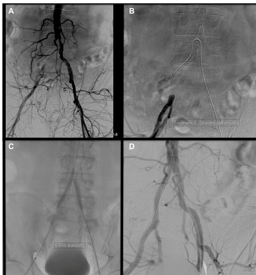
Figure 1 Balloon-expandable stent placement for treatment of bilateral common iliac artery disease.

Although few comparative studies exist to determine the relative efficacy of one iliac stent compared with others, several anatomic subsets may favor use of one stent type over another. Table 3 lists relative advantages and disadvantages of different types of iliac stents.