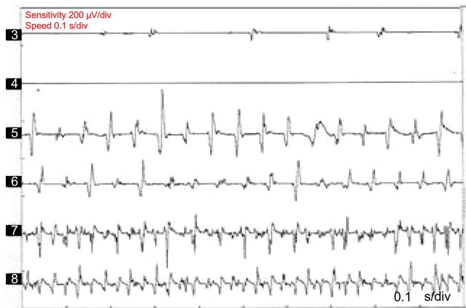
Figure 1 Polymyographic recordings in a patient with OT.

Notes: Polymyographic recordings: channels are right-sided biceps brachii, forearm flexor muscle, forearm extensor muscle, rectus femoris, anterior tibialis, and gastrocnemius, respectively. A 16 Hz tremor is seen over the rectus femoris, anterior tibialis, and gastrocnemius muscles during standing (sensitivity 200 \mu V/div, 0.1 ms/div). A very high frequency tremor also appears on the upper extremity.