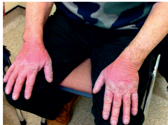
Figure 3 Photosensitive rash affecting light-exposed areas in a patient taking pirfenidone for 3 months during the winter in the North of England.

In the CAPACITY studies, 15% of patients discontinued treatment due to side effects. 17 Although this may seem high, it has been shown that between 4% and 26% of patients discontinue placebos due to perceived adverse events. 19 The level of adverse effects reported for pirfenidone is therefore not unusual in the context of a trial. Most of the patients who completed the CAPACITY trials were enrolled into an open-label extension study (RECAP) to evaluate the long-term safety of pirfenidone. 20 An interim analysis was published, reviewing data from enrollment in September 2008 until August 2013. The median duration of treatment was 163 weeks, with 99% of patients reporting at least one treatment-emergent adverse event. In more than one-third of patients, these included dyspnea, cough, or bronchitis, as well as upper respiratory symptoms of infection or nasopharyngitis. In total, 33% of patients also experienced nausea, with just less than one-third complaining of fatigue and dizziness. Rash and photosensitivity were less of a