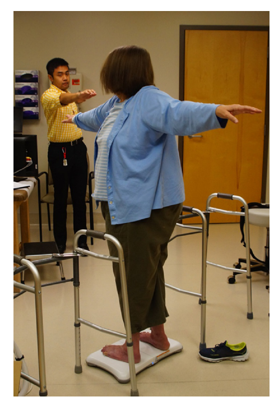
Figure 1 Setup of researcher, participant, TV, and Wii Balance Board during the Torso Twist balance task.

The first activity selected from the Wii Fitness program was the Torso Twist activity, which requires patients to raise their arms parallel to the ground and rotate it 90^{\circ} to one side,