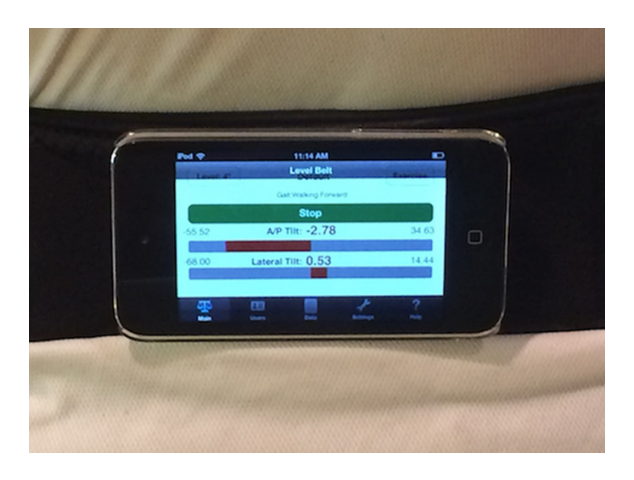
Figure 2 Placement and screen display of iPod Touch Level Belt measuring lumbopelvic tilt during a 40 m walk.

The application uses an accelerometer-based sensor to measure AP and ML tilt as the participant walks. The participant is instructed to walk normally for 40 m to the end of the hall and stop. The screen displayed during the walking trial is shown in Figure 2. The data obtained during the middle half of the walking stage were used in the study in order to capture the normal gait phase of walking and not acceleration or deceleration phases of a walk. The procedure was repeated three times.