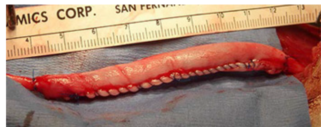
Figure 1 An 8-cm long peripheral nerve gap bridged with a collagen tube filled with PRP. Note: Axons regenerated entirely across the gap, through the distal nerve, and reestablished good neurological function.

The clinical “gold standard” surgical technique used for restoring neurological function of a peripheral nerve with a gap when the nerve stumps cannot be anastomosed is to bridge the gap with sensory (sural) nerve grafts. The concept is that the Schwann cells within the graft will release a cocktail of neurotrophic and the other factors will support the survival of axotomized neurons, induce their regeneration across the gap in association with the nerve graft, and promote axons to regenerate into the distal portion of the nerve, into which they normally do not regenerate. However, such grafts have significant limitations and are not very effective for nerve gaps >2 cm, for repairs performed >2 months post trauma, and in patients >25 years of age. Although motor nerve grafts are more effective, they are not used due to ethical reasons of sacrificing a motor function. 96