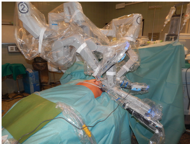
Figure 3 Patient-side cart with robotic arms introduced through the ports.