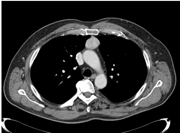
Figure 5 Chest CT scan (mediastinal window) showing small middle-mediastinal thymoma.