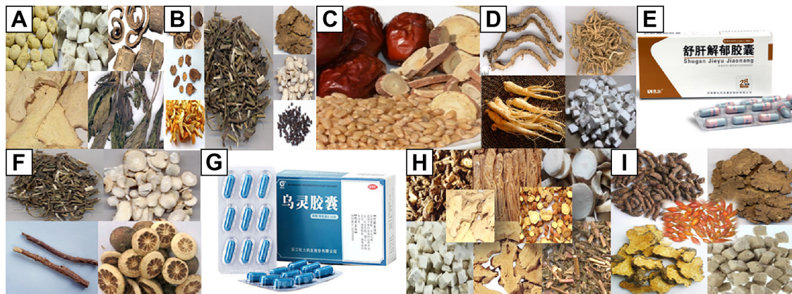
Figure 1 The nine formulas examined in this review.

suye were the core herb pairs to alleviate depression-like serotonergic and dopaminergic changes in mice. 33 Furthermore, aqueous and lipophilic extracts of BHD showed the greatest antidepressant effects, whereas the polyphenol fraction showed a moderate effect. 22 BHD reduced immobility time in the forced-swim test (FST) and tail-suspension test (TST), increased 5-HT and 5-hydroxyindoleacetic acid levels in the hippocampus and striatum, and decreased serum and liver malondialdehyde (MDA) levels in mice with a depression-like phenotype. 34 Ethanol and water extracts of BHD reduced c-Fos expression in cerebral regions of rats subjected to chronic mild stress (CMS) to a level comparable to that of fluoxetine. 35 BHD significantly