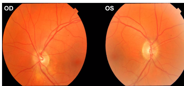
Figure 1 Fundus exam of a patient with ON on the right eye (OD).

Abbreviations: OD, oculus dexter (right); OS, oculus sinister (left); ON, optic neuritis.