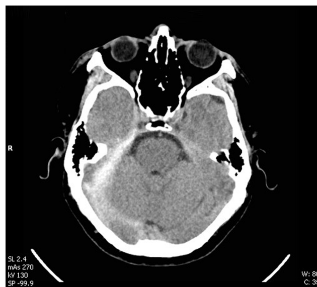
Figure 2 Noncontrast CT scan of the head prior to surgical evacuation (inferior section).