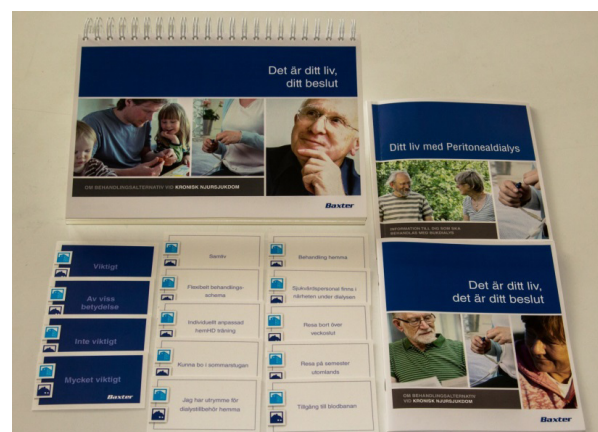
Figure 1 UPS-EP tools (Swedish version).

Abbreviations: UPS, unplanned dialysis start; EP, educational program.