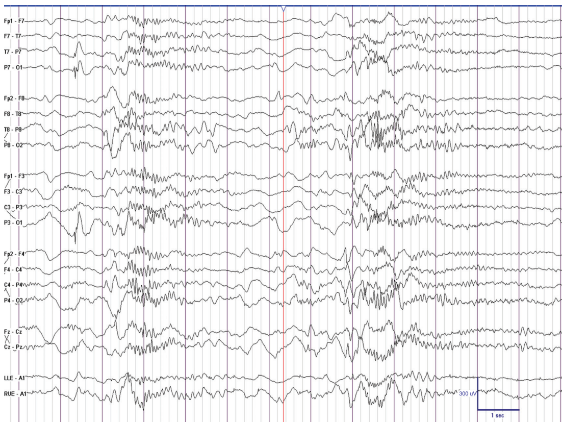
Figure 2 This is an EEG of an 8-year-old boy with Lennox-Gaustaut syndrome demonstrating paroxysmal fast activity during sleep. There were no observable clinical changes noted during the discharge.